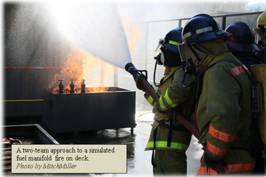
A two-team approach to a simulated fuel manifold fire on deck.